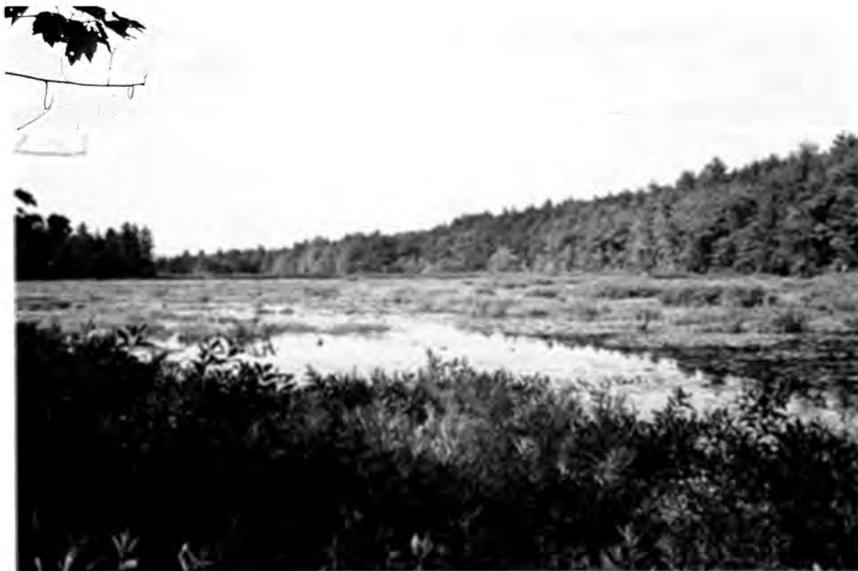
North end of Harvard Pond showing water lilies and the bog mat of leatherleaf.

Front Cover: Chamaecyparis thyoides (White Cedar), scanning electron micrograph of young cone (x240), collected April 20, 1989 at Cedar Swamp, Gardner, Massachusetts. The flask-shaped structures are ovules (young seeds) shortly before the time of pollination. This cone is comparable to many other Cupressaceae in lacking an ovule-supporting scale, a structure otherwise considered to be characteristic of conifers.