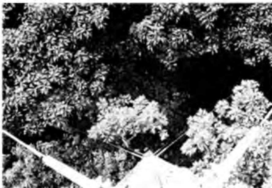
The newly erected tower at the Environmental Monitoring Station provides an unusual view down onto the forest canopy of oak and maple.

Chemical Climate and Gas Flux Analysis. Another focus of activity during the first year has been acquisition and testing of equipment and modification of our data handling software and hardware to permit gas flux analysis. An important aspect of this measurement program is the determination of fluxes of reactive nitrogen compounds ( \text{NO}_y ) to the forest. The flux of \text{NO}_y will be determined by the eddy correlation method. A second measurement system that has been developed is a device to measure directly the photolysis rate for \text{NO}_2 .