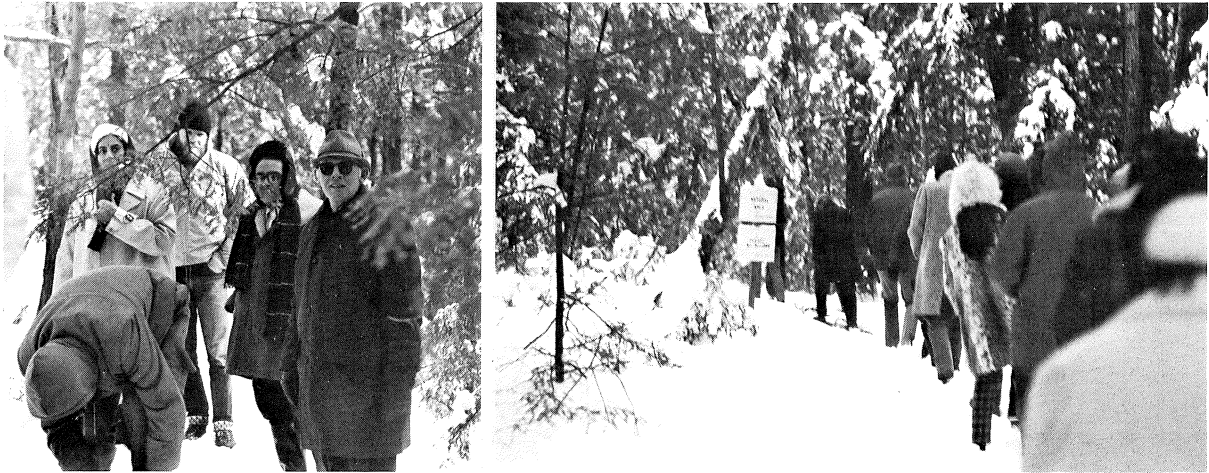
Above: Members of the Plant Development Workshop on a Forest trail

After two years of planning, the third Cabot Symposium was held here on April 8-12, 1974 under the title "The Structure and Function of Roots". About 35 scientists discussed roots, their anatomy, physiology, biochemistry and function in relation to the whole plant. Research workers from around the world were assembled under the auspices of the Maria Moors Cabot Foundation for Botanical Research. Those coming from the greatest distance were from Australia; others came from Great Britain, Holland, Canada, Czechoslovakia and, of course, many from this country. The symposium will be published in book form as were the two previous symposia.