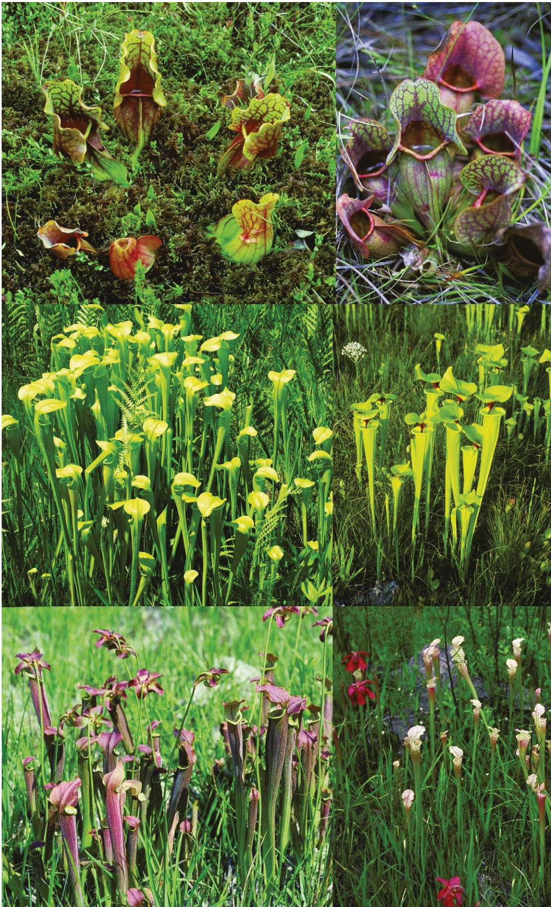
FIG. 1. Examples of different species of Sarracenia. Top row: Sarracenia purpurea (left); S. rosea (right). Middle row: S. alata (left); S. flava (right). Bottom row: S. alabamensis subsp. wherryi (left); S. leucophylla (right).