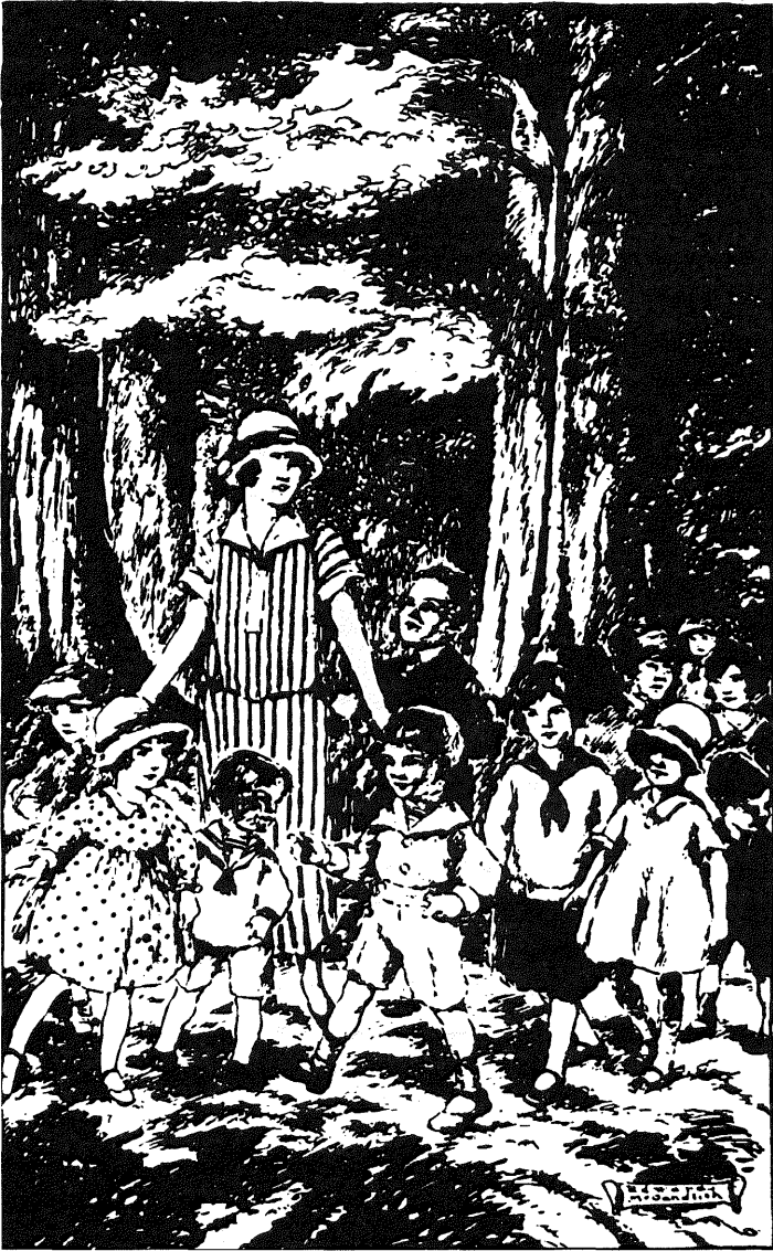
Recreation and Nature Study Are Assets of the Forests

Figure 2. The concept of forests as sites for recreation, education, and nature appreciation (“islands of peace”) led to a reconstituted Massachusetts Forest and Park Association and to the system of memorial forests currently maintained by the New England Forestry Foundation. Vignette from Harris Reynolds’s 1925 monograph Town Forests: Their Recreational and Economic Value and How to Establish and Maintain Them .