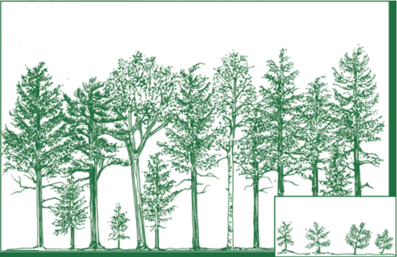
Fig. 1 TYPICAL HEMLOCK STAND with some hardwood and pine. Note very few seedlings/saplings.

T he introduced HEMLOCK WOOLLY ADELGID (HWA; Adelges tsugae Annand) continues to migrate north into New England, causing widespread hemlock decline and mortality, leading to associated salvage and pre-salvage cutting across the region. Continuing HWA outbreaks lead to management dilemmas about pre-salvage and salvage logging in hemlock stands: should they be cut or not?