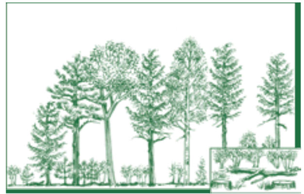
Fig. 4 LIGHT CUT YEAR 5 —If harvested lightly in the first year, greater light reaches the forest floor by year 5, resulting in more hardwood undergrowth development.