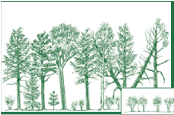
Fig. 2 UNCUT YEAR 5 —Hemlock woolly adelgid results in standing dead trees and thinning crowns; some modest increased light results in more hardwood undergrowth.