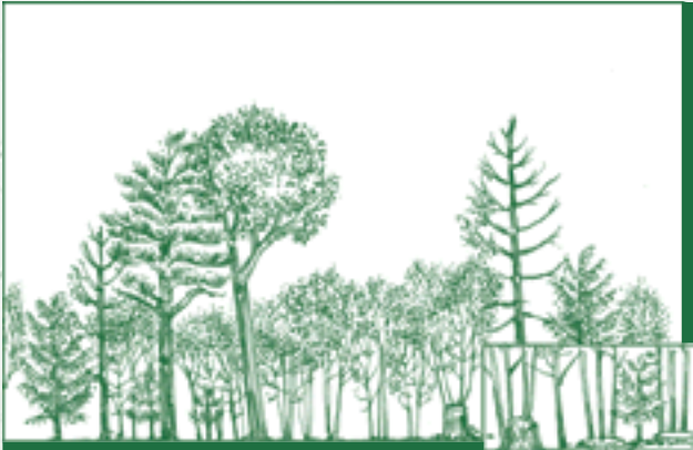
Fig. 7 HEAVY CUT YEAR 15 —By year 15 new hardwood forest is strongly developed.