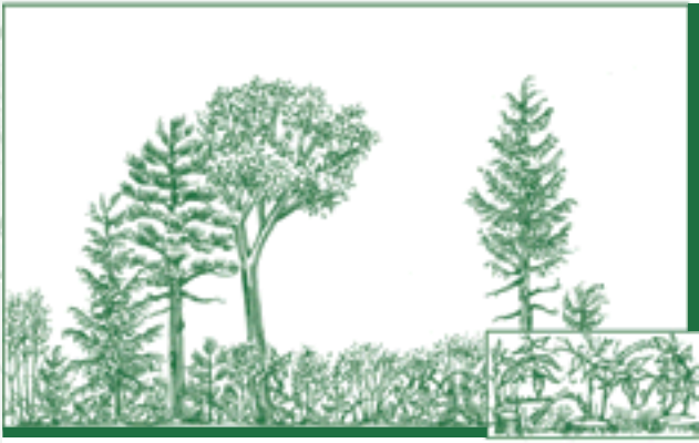
Fig. 6 HEAVY CUT YEAR 5 —If the stand is heavily cut in the first year, high light levels result in aggressive new hardwood vegetation by year 5. There is little dead or dying woody material.