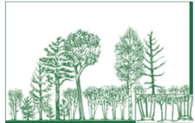
Fig. 5 LIGHT CUT YEAR 15 —By year 15, hardwood undergrowth has developed more, and some crown thinning has occurred in hemlock that remained.

For example - Hemlock trees growing on ridgetops, on exposed drier sites, or infested with any other secondary pests like scale insects often succumb more quickly to HWA infestation. In addition, extreme cold winter temperatures (below -5^{\circ}\text{F} or -20^{\circ}\text{C} ) for even a few hours can cause severe HWA population reductions, which may temporarily slow the spread and impact of HWA across the landscape. Research has also shown that hemlock trees are just as likely to be infested with HWA whether they occur in a hemlock-dominated system or in mixtures with hardwoods or other conifer species.