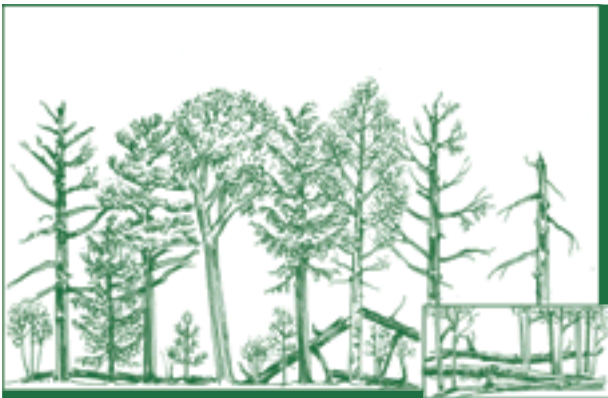
Fig. 3 UNCUT YEAR 15 —There has been additional hemlock mortality, standing dead wood, accumulation of woody debris, and slight development of hardwood undergrowth.