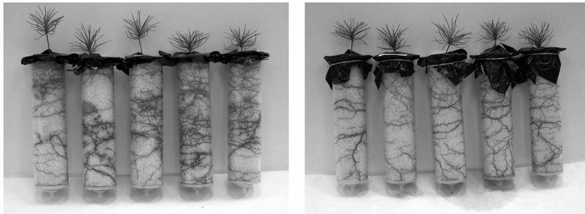
PLATE 1. Mycorrhizal colonization stimulates belowground allocation in Scots pine ( Pinus sylvestris ) seedlings (left, colonized with Cenococcum ; right, nonmycorrhizal). Seedlings were grown in semi-hydroponic perlite media to which nutrient solution was added under conditions of exponential growth.