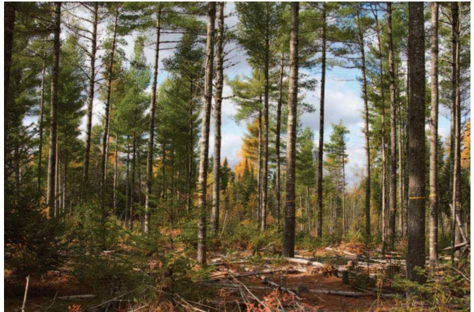
Figure 3. A field visit to the Wells Demonstration Forest, owned by a private woodland owner near Orono, Maine, in October 2013. This woodland owner is actively managing this forest through repeated thinning and the occasional biomass harvest.

Currently, the TPB (Ajzen 1991) is the most prominent research theory in natural resource management for understanding human behavior. The TPB has worked well in predicting behaviors such as voting, blood donation, choice of religion, and contraceptive use (Kraus 1995). More specifically, the attitude-behavior correlation is much stronger when attitudes and intentions are easy to recall and relatively stable over time (Glasman and Albarracín 2006). However, critics claim that the model only works on behaviors that require no skill and immediately follow the formation of intention (i.e., short-term planning) because the model implies a very simplistic causal structure (Liska 1984). TPB has been applied to human dimensions of natural resources by predicting intentions or understanding preferences and willingness to pay or act. For example, TPB has been used to understand hunting intentions and behaviors (Hrubes et al. 2001). In addition to application of TPB to timber harvesting behavior, it has also been used in contingent value forest economics research